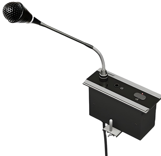
Table Embedded Delegate Microphone