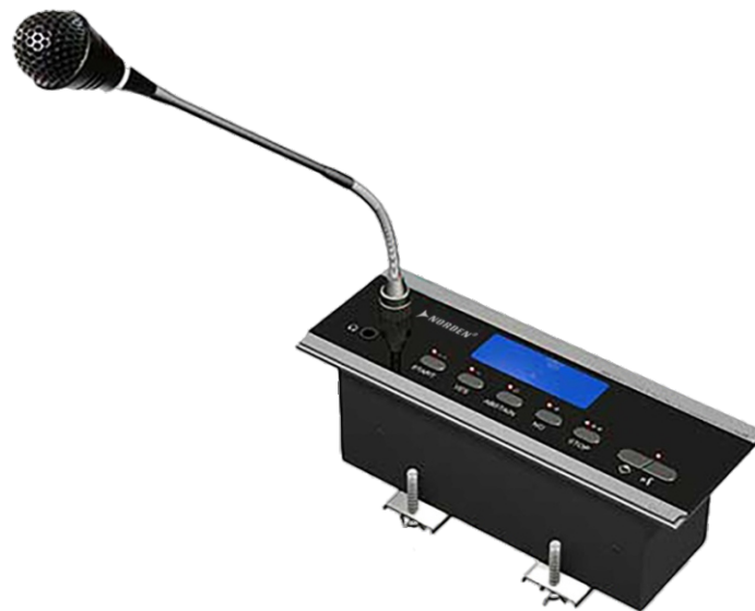
Table Embedded Chairman Microphone with Voting Function