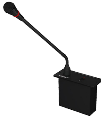
Table Embedded Delegate Mic